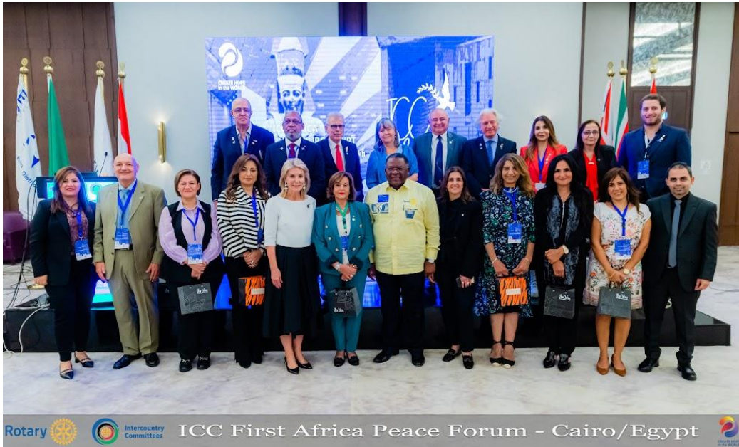
Rotary Intercountry Committees ICC First Africa Peace Forum - Cairo/Egypt