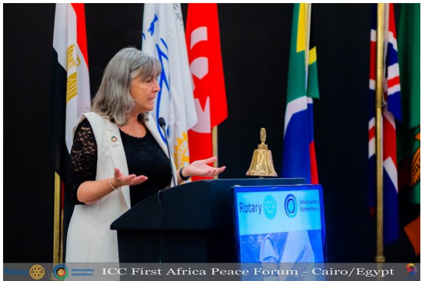
Rotary Intercountry Committees ICC First Africa Peace Forum - Cairo/Egypt