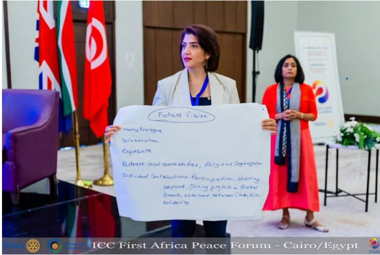
ICC First Africa Peace Forum - Cairo/Egypt