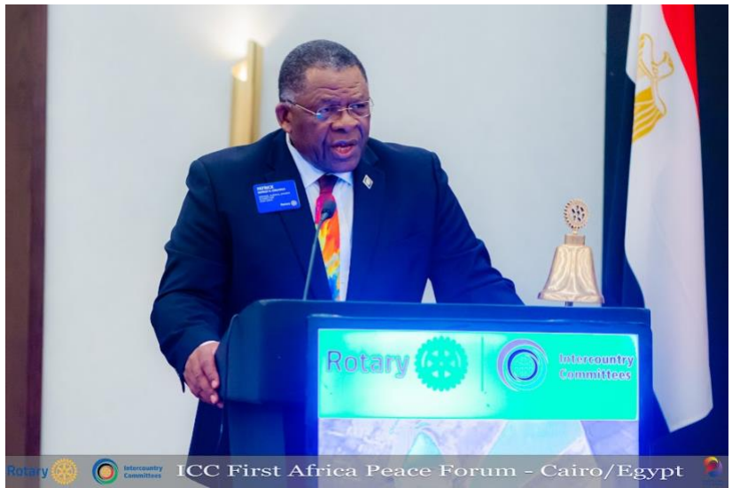
Rotary Intercountry Committees ICC First Africa Peace Forum - Cairo/Egypt