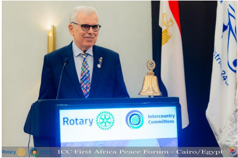
Rotary Intercountry Committees ICC First Africa Peace Forum - Cairo/Egypt