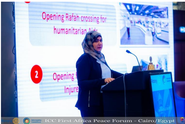
ICC First Africa Peace Forum - Cairo/Egypt